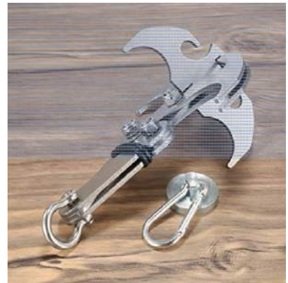
Small Grapple Hook Buy HERE