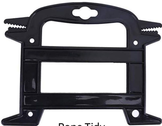
Rope Tidy Buy HERE