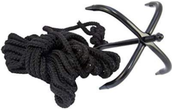
Military Style Grappling Hook Buy HERE