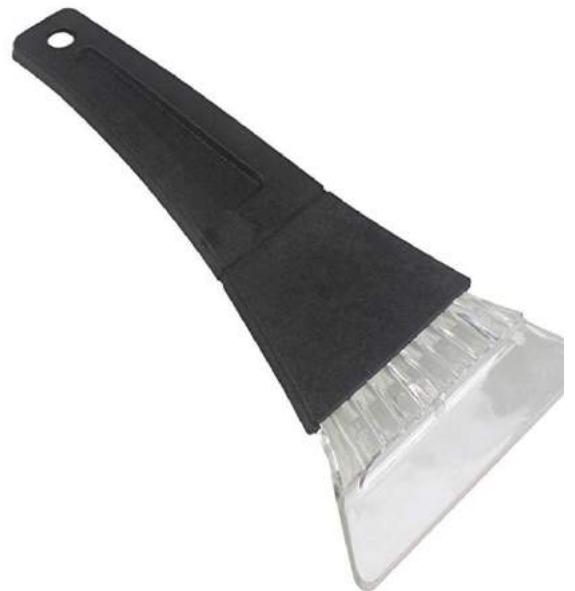
Ice scraper Buy HERE